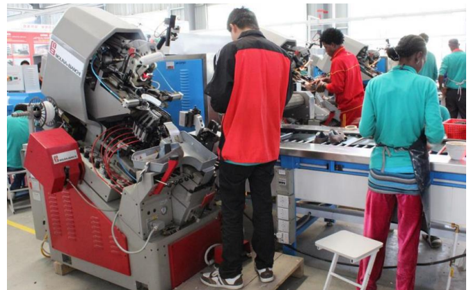
Figure 2 - Huajian Shoe Factory Assembly Line

There are clear differences between the two firms. Cheap labor was discovered to be the main reason for Huajian's investment, as average Ethiopian salaries are only US$35 per month, which is about ten times as low as those of the firm's Chinese workers. Huajian entered Ethiopia at a relatively large scale, and quite rapidly, at a time when local supplies of quality skins and hides were already tight. They were unable to source all of their raw materials locally, and thus at the time of our research, six months after they had started production, they were importing 70 percent of their leather supply. The Chinese managers trained Ethiopian staff, most of who were newly graduated college and high school students, and sent 86 Ethiopians to China for 2 months of training in November 2011. They view this as an investment in the future of a skilled Ethiopian staff. Further, their location 35km from Addis Ababa, along with their plan to build a leather products focused industrial zone close to Ethiopia's principal leather-making cluster, will create opportunities for technology spill-overs to local firms. Huajian has signed a memorandum of understanding with the China-Africa Development Fund (CADF) to invest $2 billion to build a shoe production base in Addis Ababa over the next 5 years.