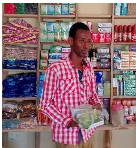
Figure 1: Retail shop in Garissa County village

effect of kinship taxation on the productive decisions of micro-entrepreneurs in Garissa, Kenya 1 .